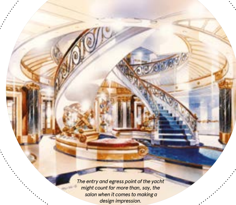
The entry and egress point of the yacht might count far more than, say, the salon when it comes to making a design impression.

into raging lunatics,” says Kopec. “Take passenger rage on commercial flights...measurable increases in adrenal secretion. Boeing did a lot of groundbreaking studies on the territorial crowding that went into its Dreamliner 787. In the end, they were actually able to add more seats, but create a greater feeling of space.